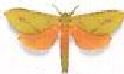
Green and Orange