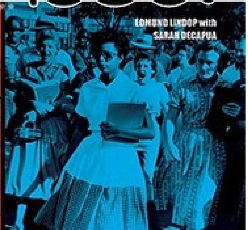
America in the 1950s (The Decades of Twentieth-Century